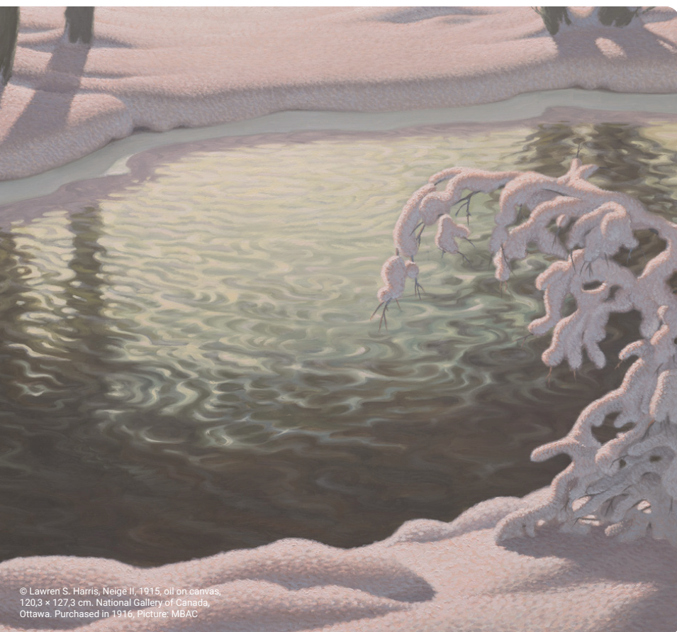
© Lawren S. Harris, Neige II, 1915, oil on canvas, 120,3 x 127,3 cm. National Gallery of Canada, Ottawa. Purchased in 1916.